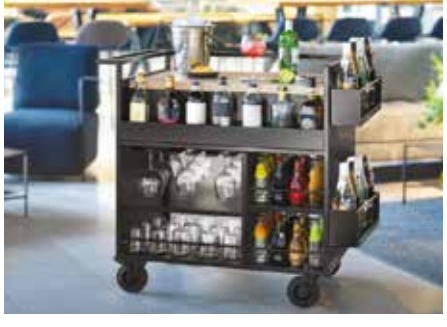
trolley are 915mm (w) x 630mm (d) x 980mm (h).

The carbon steel structure has an anti-rust coating and a stylish satin black finish. The trolley is easy to move with heavy-duty swivel wheels, two of which are braked. The overall dimensions of the compact